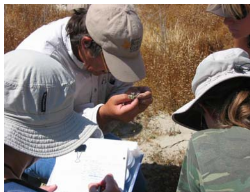
SJWA Plant Walk, April 2008