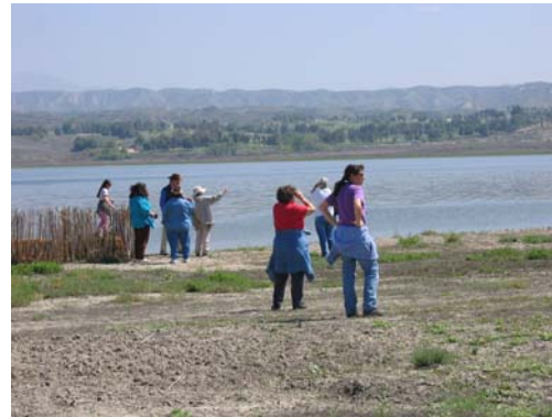
Mystic Lake Walk, April 8, 2006