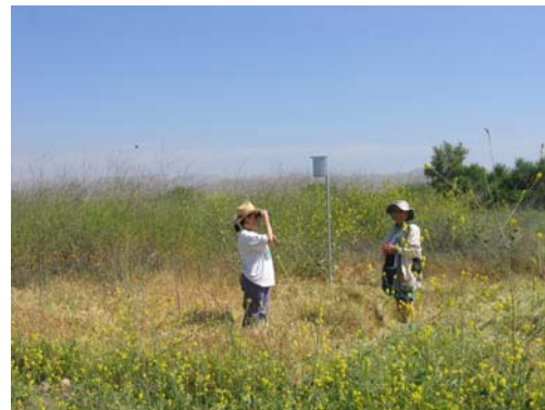
Bluebird Box Walk, May 14, 2006