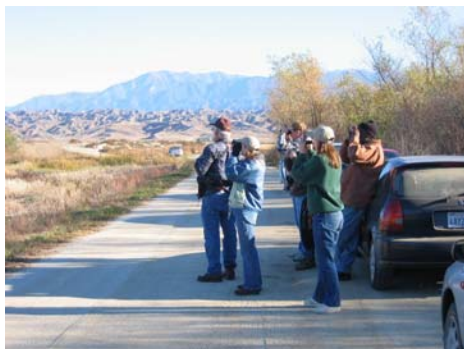
Beginning Bird Walk, December 4, 2005