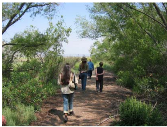
SJWA/Walking to the Reclaimed Water Ponds

Following that GPAC meetings, the County plans to release the Draft Environmental Impact Report (DEIR).