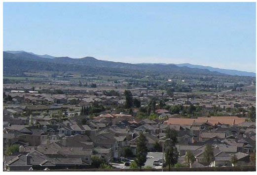
"Prevent Urban Sprawl"