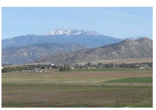
"Preserve the San Jacinto Wildlife Area"

The Friends of the Northern San Jacinto Valley is a volunteer organization. We have spent many years taking part in the approval process for the VOL project. Our members attended public meetings on the project; we submitted lengthy comments; we met with four County Supervisors to express our concerns.