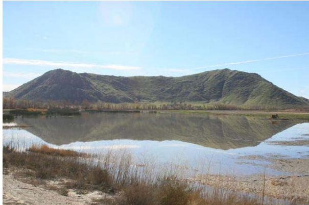
Marsh A, SJWA, January 2009