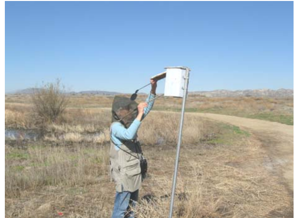
Cleaning Bluebird Boxes, SJWA, February 2009