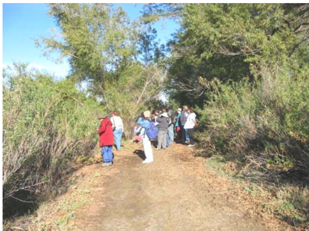
Trail from Viewing Platform, SJWA

QUAIL RANCH SPECIFIC PLAN by Ann McKibben: The Friends commented on the Notice of Preparation for this project in February 2008. The proposed project would place approximately 1,500 units on 1,263 acres of land. The project site is located along Gilman Springs Road, north of Jack Rabbit Trail and is about three miles south of Highway 60. It is outside the city limits but within its sphere of influence. The project area is directly across the road from the north end of Mystic Lake and the San Jacinto Wildlife Area (SJWA). The Quail Ranch Golf Course will be redesigned so the golf course is placed in the Alquist-Priolo Zone of the Claremont Strand of the San Jacinto Fault along Gilman Springs Road. Planner for the project is: Jeff Bradshaw, (951) 413-3224.