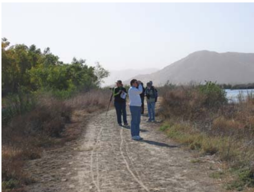
Beginning Bird Walk, December 2006