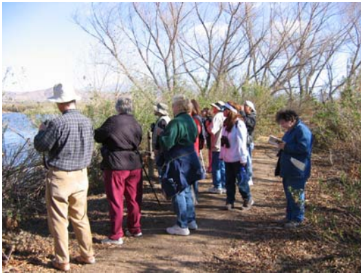
Nature Walk, SJWA, January 21, 2007