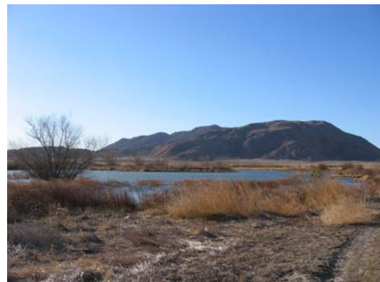
Scenic View, December 2006